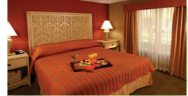
...Then, relax in luxurious accommodations

Shopping/Personal—Mental Therapy/Free Time Noon - Until