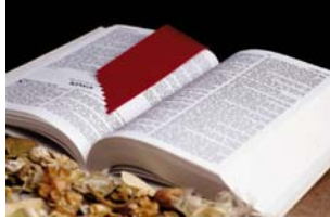
Get an exciting and rich word...